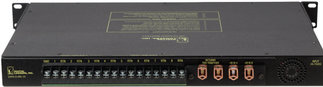
-48V Smart Switch